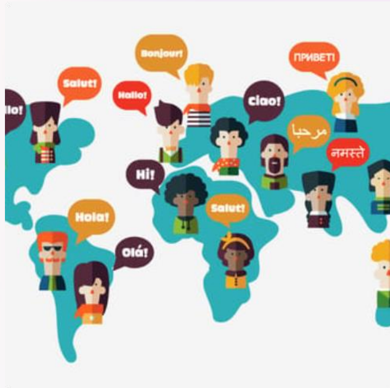
The Diverse World of Languages

Language is incredibly diverse and complex, with thousands of unique languages and dialects spoken around the world.